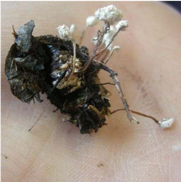
Left – the Cordyceps on a beetle larva. There was another conspicuous fungus at More's Bush, a Flower fungus

that invades an insect larva and takes over its body, effectively mummifying it. This one was infecting a beetle larva. The best-known of the Cordyceps is the Vegetable caterpillar, a large caterpillar hardened by the fungus which sends up a single spore stalk.