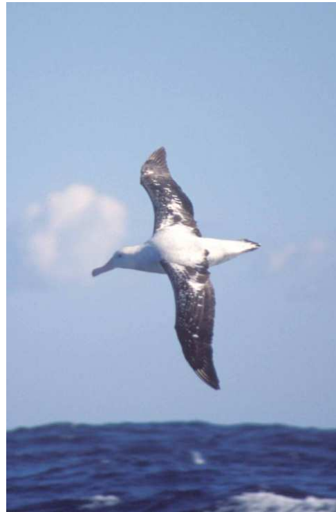
Wandering Albatross

time (21-24 May 2004) it was a great to get out on the water. It does mean in future we'll be organising some