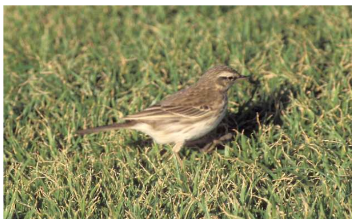
NZ Pipit at Cape Reinga

Calm conditions clear sky, stunning morning. Left Houhora dock at 7.45AM. SST 14C at the Heads. However, once we'd rounded Mount Camel and were out in the bay it was clear a big swell was still rolling in. But we were committed and started heading ENE to keep in the protection of Moturoa Islands for as long as possible. Soon picked up 100s of Fluttering Shearwaters and 10s Diving Petrels with the occasional gannet. Also, a solitary Buller's Shearwater. Noted the amount of fish life below the feeding flocks of Fluttering Shearwaters (on the sounder).