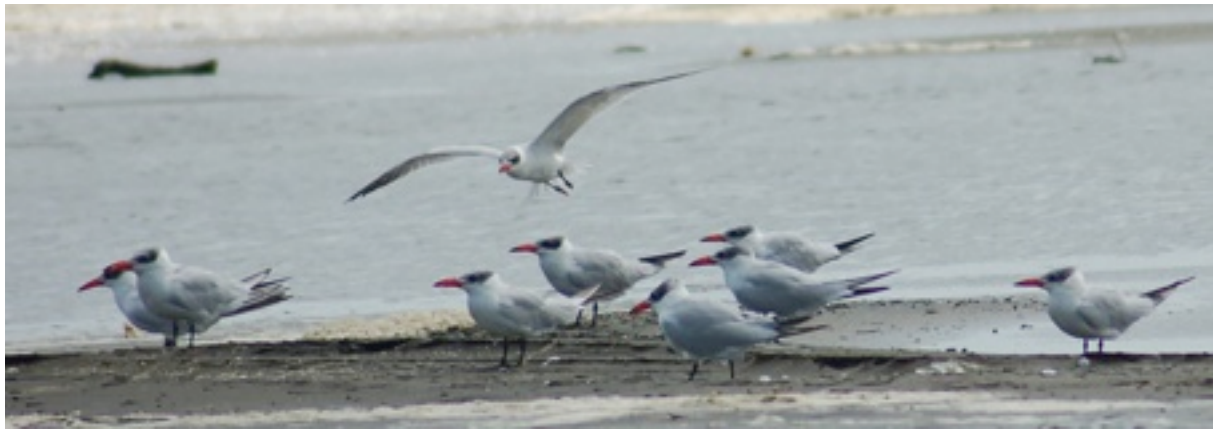
Caspian Terns at Manukapua (Big Sand Island), off the Okahukura Peninsula near Tapora on the Kaipara Harbour. (Photo: Suzi Phillips).