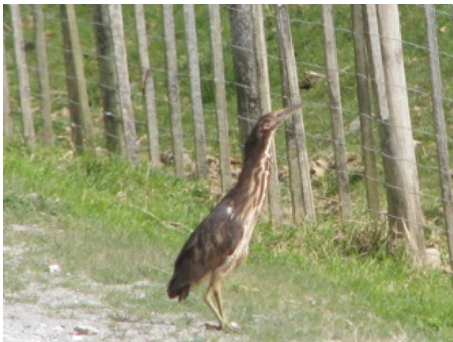
This Australasian Bittern was seen roadside near Sandpiper Lodge on the Takatu Peninsula, in August last year. The Lodge is within the buffer zone of pest control done to support the open sanctuary at Tawharanui Regional Park. Photo and sighting report from Christine Rose.

Tawharanui Regional Park on Saturday 21st, (sunny and warm). An hour's walk about 400m, mainly along the stream before it enters the forest proper by Erik Forsyth . Fantastic to see all the fledglings from several species, appears to have been a good breeding season. Birds recorded: Buff-banded Rail - a single bird bathing in the left lagoon 300m from the entrance, Brown Teal x10 or so in the same lagoon and x3 along the stream, NZ Kaka - 3x flyovers by single birds, Bellbird - many fledglings calling for food, Tui - several recently fledged birds seen, NI Robin - an adult feeding a fledgling 100m along the stream, Grey Warbler - only 2 heard singing, Whitehead- a birding calling from the pines at the beach carpark and x2 family groups with adults feeding young 150m along trail, (x2 birds seen without bands including a singing male). Grey Fantail- several groups feeding young, Laughing Kookaburra- a single bird on the wires between the park and Sandpiper Lodge.