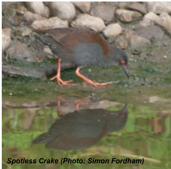
Spotless Crake

We presume the crakes have self-introduced from Tiritiri Matangi Island where there is a thriving population, but limited habitat which prompts such expansion. The Crakes introduced themselves to Motuora Island three years ago and are now breeding there. The wetland areas on