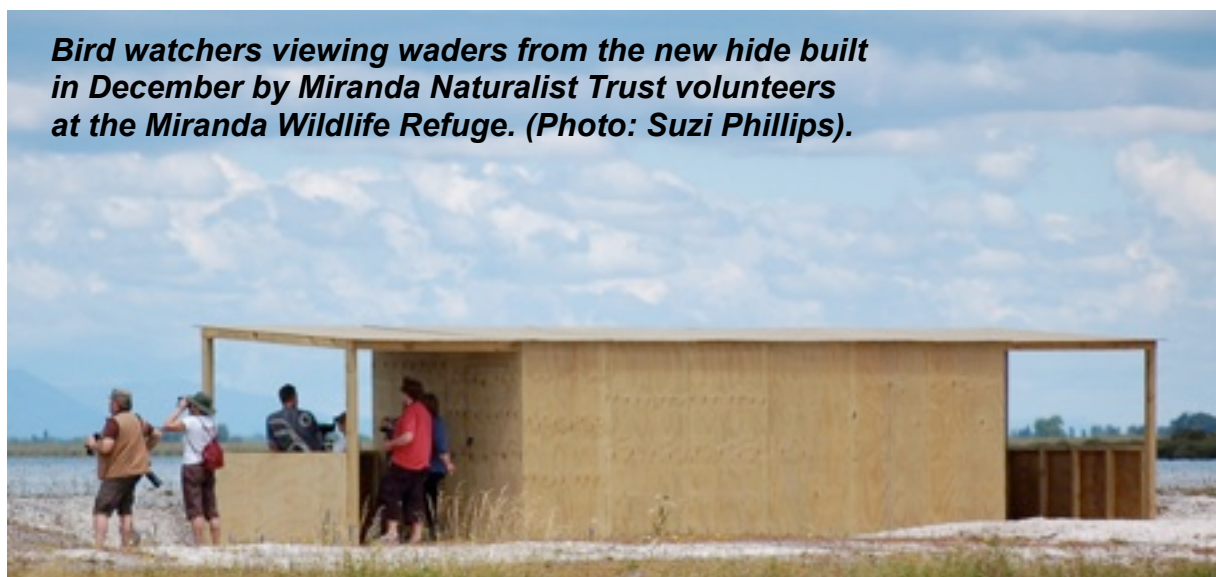
Bird watchers viewing waders from the new hide built in December by Miranda Naturalist Trust volunteers at the Miranda Wildlife Refuge.