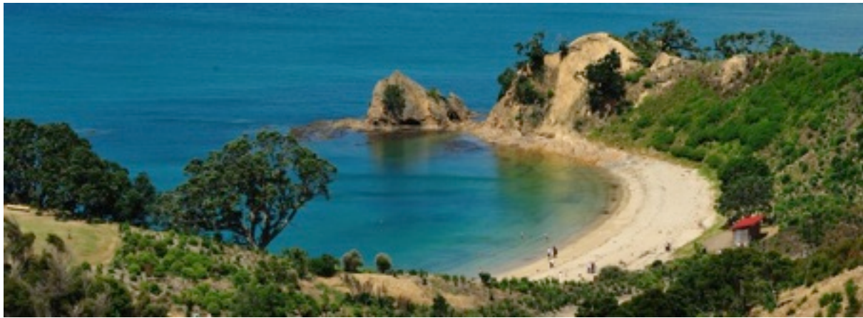
One of the delightful and popular bays on Rotoroa Island.