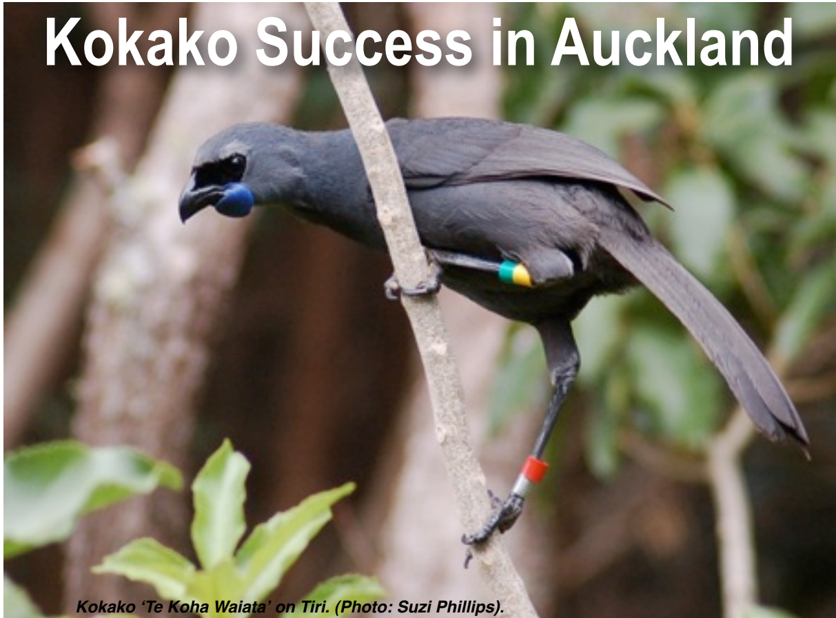
Kokako 'Te Koha Waiata' on Tiri.

Kokako are one of New Zealand's most unusual and exciting rare endemic birds and due to conservation efforts, are becoming increasingly accessible to keen bird watchers in the Auckland region.