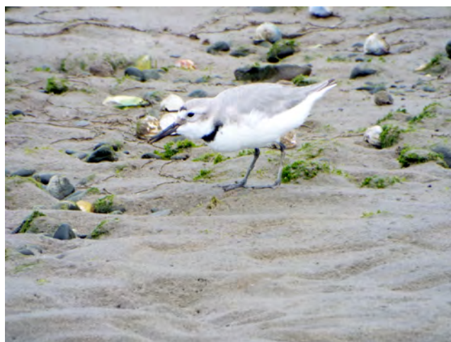
A Wrybill seen on November's ramble.

On November 14 th a group of seven people met at the Ashley Estuary on a cool sunny day to see what feathered delights were around. We passed a young shag sitting contentedly on driftwood, a community of terns chattered and bustled noisily, quite a few godwits were away on the sand banks, and Wrybills were scratching around at the waters edge. We saw Variable