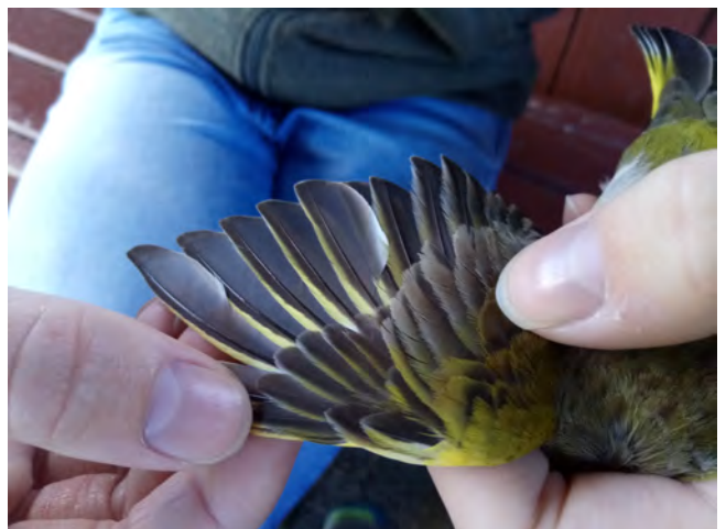
Checking the wing of a Greenfinch.