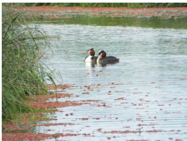
The pair of Great Crested Grebes.