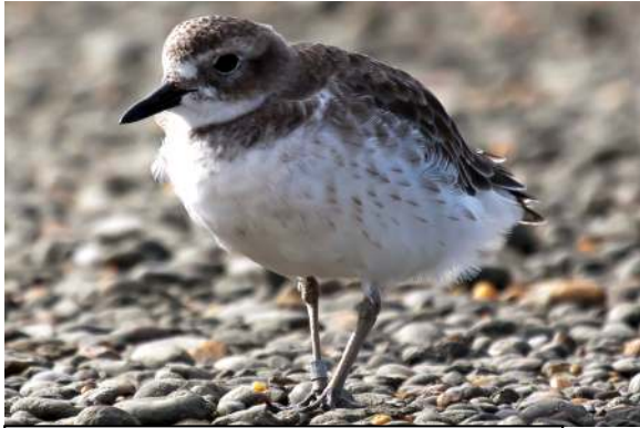
New Zealand Dotterel