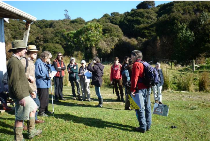
At the briefing at Kelvin's Manse Rd farm.

The first survey day was blessed with stunning sunny calm spring weather and about 14 people turned up at Manse Road farm just off Blueskin Bay, to practise survey methods for Beyond Orokonui survey.