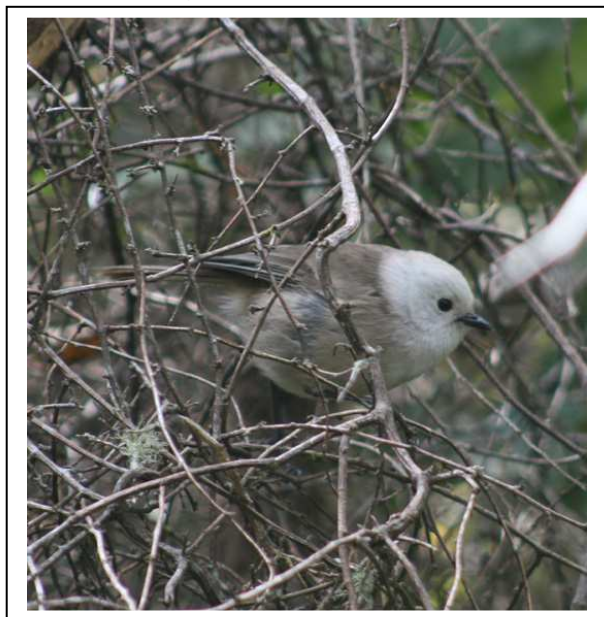
Whitehead and Stitchbird, Tiritiri Island (Detlef Davies)

Future bookings for the bunkhouse on Tiritiri will need to be made online but please note that OSNZ local groups often have block bookings and we can make enquiries about these.