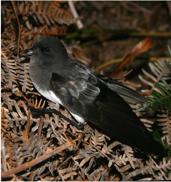
Grey-backed Storm Petrel, Tuku light site (DD)

The story of the Chatham Island Taiko or Magenta Petrel is remarkable. It was discovered in 1867 when a specimen was taken in the mid Pacific by crew aboard the Italian research ship 'Magenta'. There were very few other sightings over the next hundred years and clearly the bird was a rarity. In the 1950s and 1960s it was shown that seabird bones found on Chatham Island were the same species as the original 1867 specimen, and searching for them began in 1973. On 1 January 1978 David Crockett captured the first Taiko and since then an intense research and banding programme started. The total population is not known but may be as few as 50. The breeding area has predators and the terrain does not lend itself to predator-proof fencing. There is now such a fence in a new area to where it is hoped to transfer chicks to create a new colony.