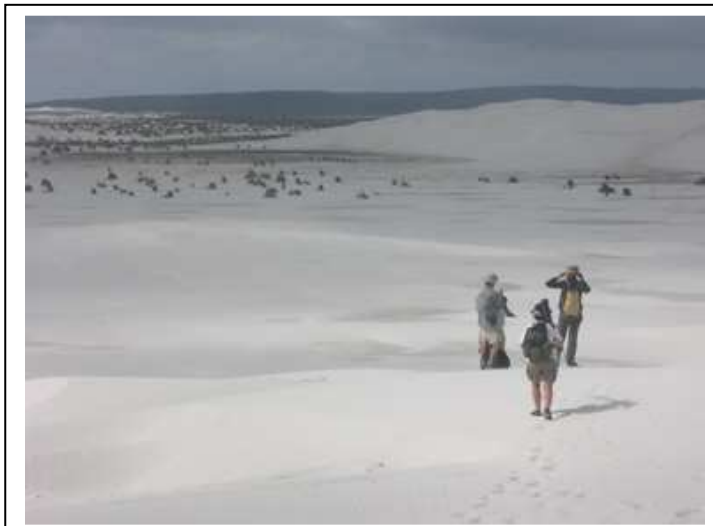
Wader roosts, Kokota Sandspit & Walker Island