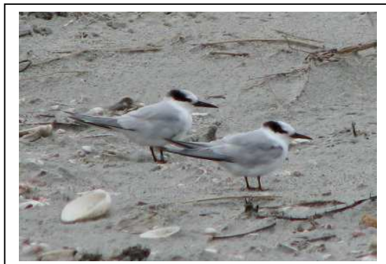
Eastern Little Terns & NZ Dotterel chick East Beach, 11 Dec Kevin Matthews

This will ensure that sightings will be reported to the original flagger promptly, and that no valuable records are lost All flag observations will be acknowledged with a formal flag-sighting report