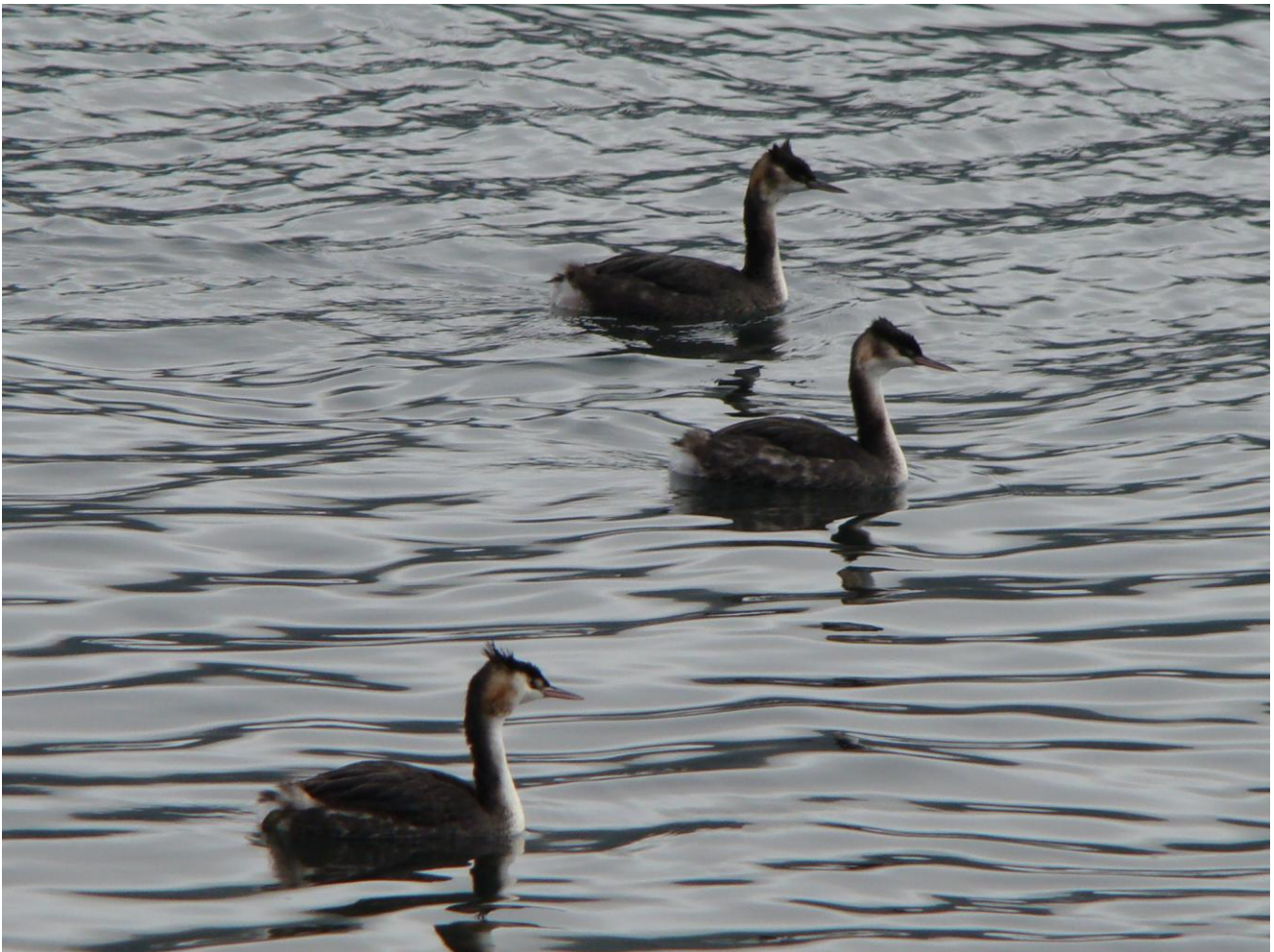
Sunday 27 June at the bottom of Luss Road, Otago Harbour.

Otago Region Newsletter 7/2010 July 2010