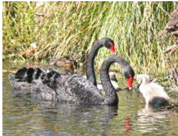
"Two heads are better than one" (Peter Frost)