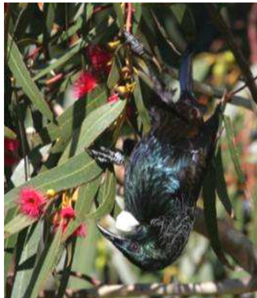
Tui feeding in a flowering gum (Ormond Torr)