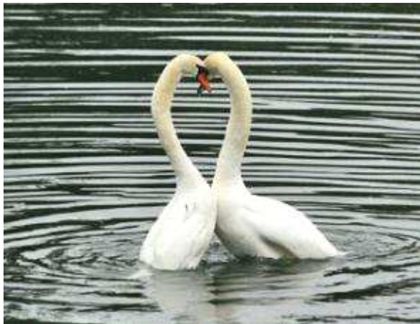
"Love scene from Swan Lake" (Ormond Torr)

Royal Albatross: a juvenile found on a dairy farm on Taylor Rd, near Sanson, on the 5th August (DM). Giant Petrel: a single bird seen off the mouth of the Wanganui River on 31 st August during a westerly gale; it was tentatively identified as a possible Southern Giant Petrel on account of its markedly pale head (PF). Sooty Shearwater: 20-30 birds seen offshore on 31 st August; identified on the basis of brownish plumage, pale flash in the underwing when the birds banked, and the characteristic quick flight consisting of rapid flapping alternating with long glides (PF). Spotted Shag: maximum number recorded this winter was 11 (25-27 June, PF). Cattle Egret: the group that has spent the past few winters on farms in the lower Whangaehu valley returned again this year; 14 birds were recorded on at the end of June (PG and PF); they were still there on 21 st September (PF). This is an increase over the 8 birds recorded in 2008 and 5 in 2007, but is still below the numbers recorded 10-20 years ago (20-40 birds). Nankeen Night Heron: 8 birds still present at the Kauarapaoa (Kemp's Pole) roost site on 8 th and 22 nd August (PF, PG and others). Royal Spoonbill: the number of birds on the Whanganui estuary fluctuated slightly from a maximum of 8 in early July to only 3 birds in mid September (PF, LD, RL). Seven birds seen on the Waitotara estuary on 16 September (RL). Canada Goose: 7 birds at Kaitoke Lake on 9 th August, the first records for that locality (OT)/