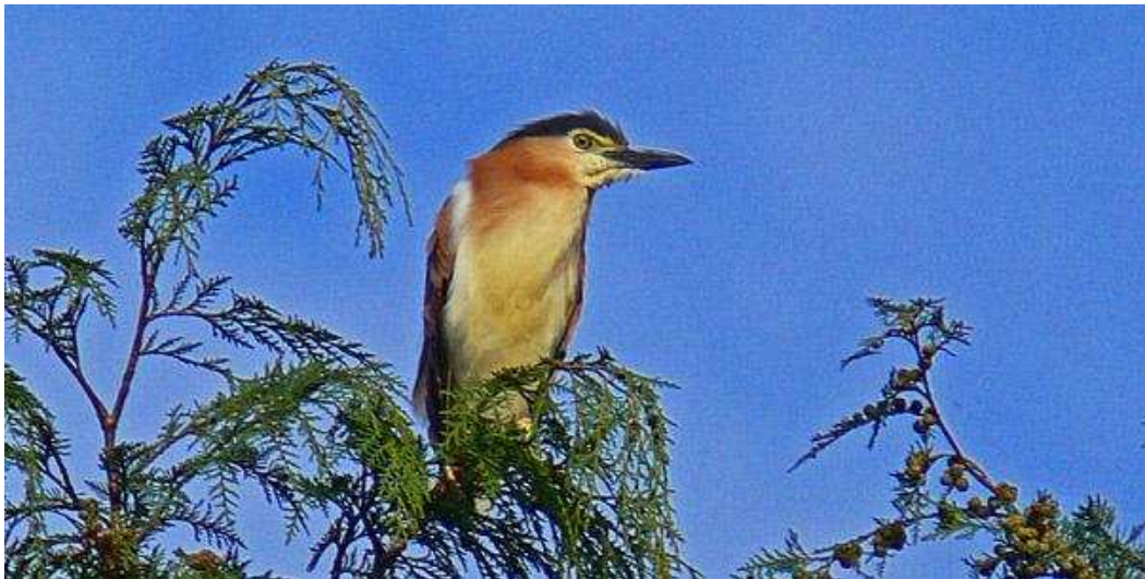
Nankeen Night-heron, showing the characteristic brownish-yellow underbody feathers

What does the word 'Nankeen' mean? 'Nankeen' is the textile trade name for a durable brownish-yellow cotton originally manufactured in the city of Nanjing, China, but now imitated in various other countries. The characteristic tint of the cloth was due to the peculiar colour of the cotton from which the cloth was made (Encyclopaedia Britannica Outline www.britannica.com/bps/search?query=nankeen ). No doubt the brownish-yellow colour of the night-heron's underbody feathers reminded someone of the cloth, hence the species' common name.