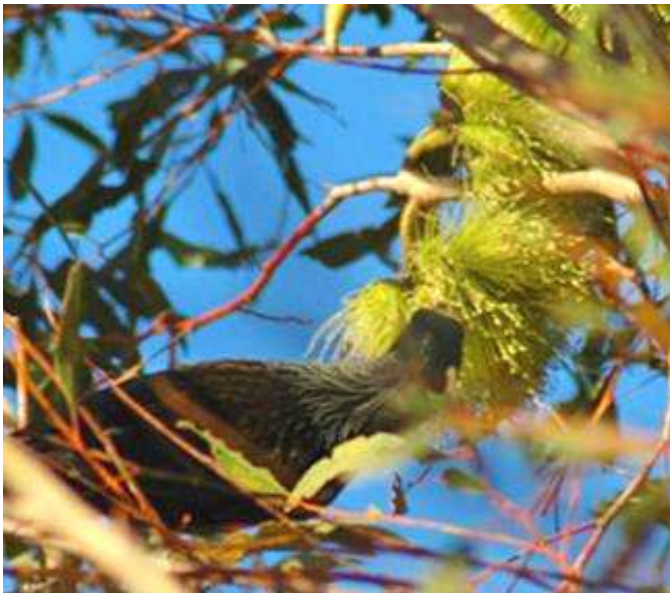
Tui feeding on E. newbeyi nectar