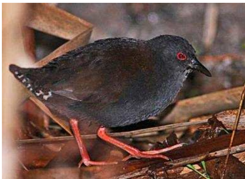
Spotless Crake photographed by Paul Gibson along the Matatara Stream on 9 September 2009. This bird moved over 20 m to an isolated clump of raupo next to where playbacks of its calls were being played.

We returned a few days later and Paul got himself into a position where he could look down through a narrow opening in the small raupo bed. This time only one bird responded to the playbacks, but it approached the loudspeaker closer than before, although seldom showing itself for more than a second at a time. Paul managed to get a couple of photographs, which show nicely the bird's sooty black plumage, tinged with chestnut on the wing coverts and upper back; the white bars near the tip of the under-tail coverts; and the red eye ring and red legs. In all, this is a tiny but handsome species, well worth the effort spent hunting it down.