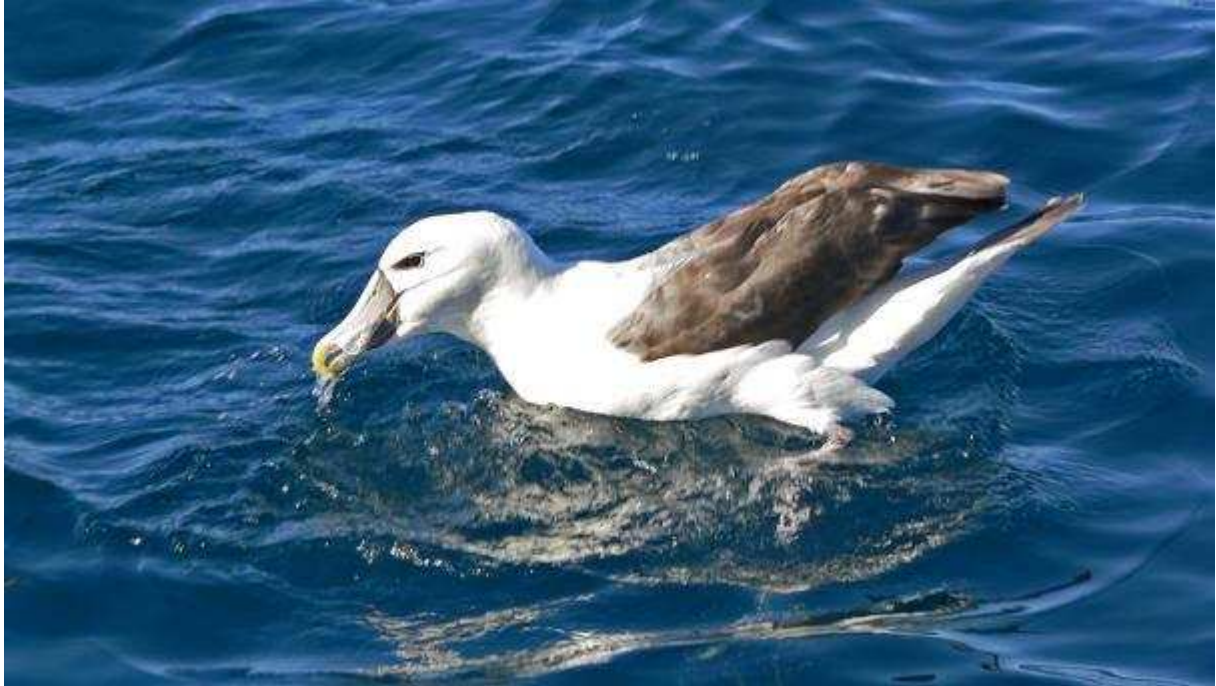
Adult White-capped Albatross feeding on a piece of discarded fish.