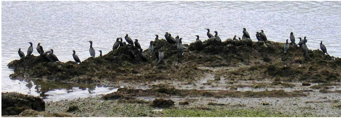
39 little black shags on rocks near the main road at Pauatahanui Inlet